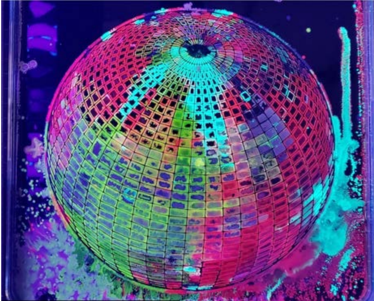
Image source: Photograph by American Society for Microbiology agar art 2019 contest, "Latitudes Leaking Longitudes," Tarah Rhoda